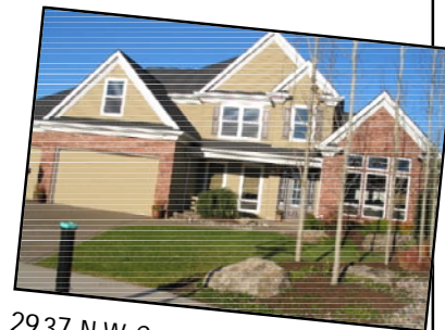
2937 N.W. Conrad Court