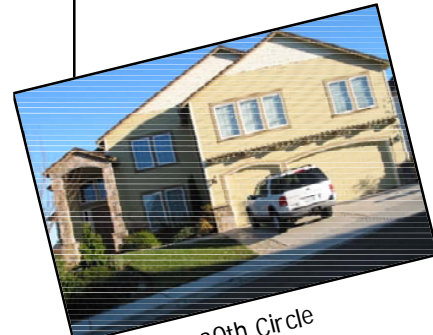
2803 N.W. 30th Circle